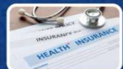
Health Insurance & Medical Emergency