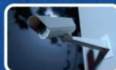
High Security with CCTV Surveillance