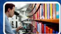
Well Equipped Labs & Library