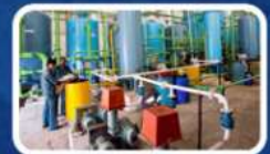
Bio Fertilizer Production Unit