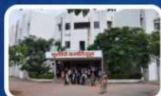
Residential & Semi-residential Campus