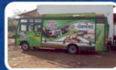
Mobile Soil & Water Testing