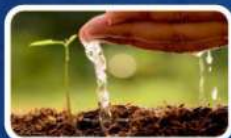
Soil & Water Conservation Practice