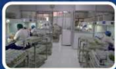
Tissue Culture Lab