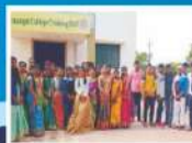
NATIONAL PHARMACY WEEK