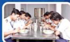
Hostel & Mess Facility