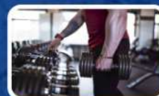
Well Equipped Gym