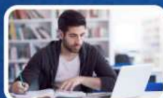
Self Study Room