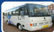
Bus Facility for Staff & Students